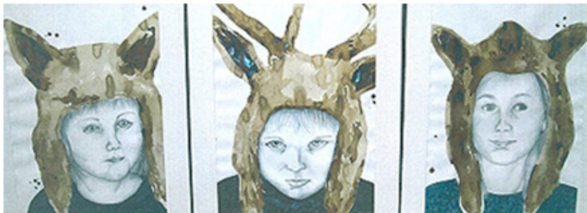
$1000 1st Prize - Alivia Buckles Prendiville Catholic College